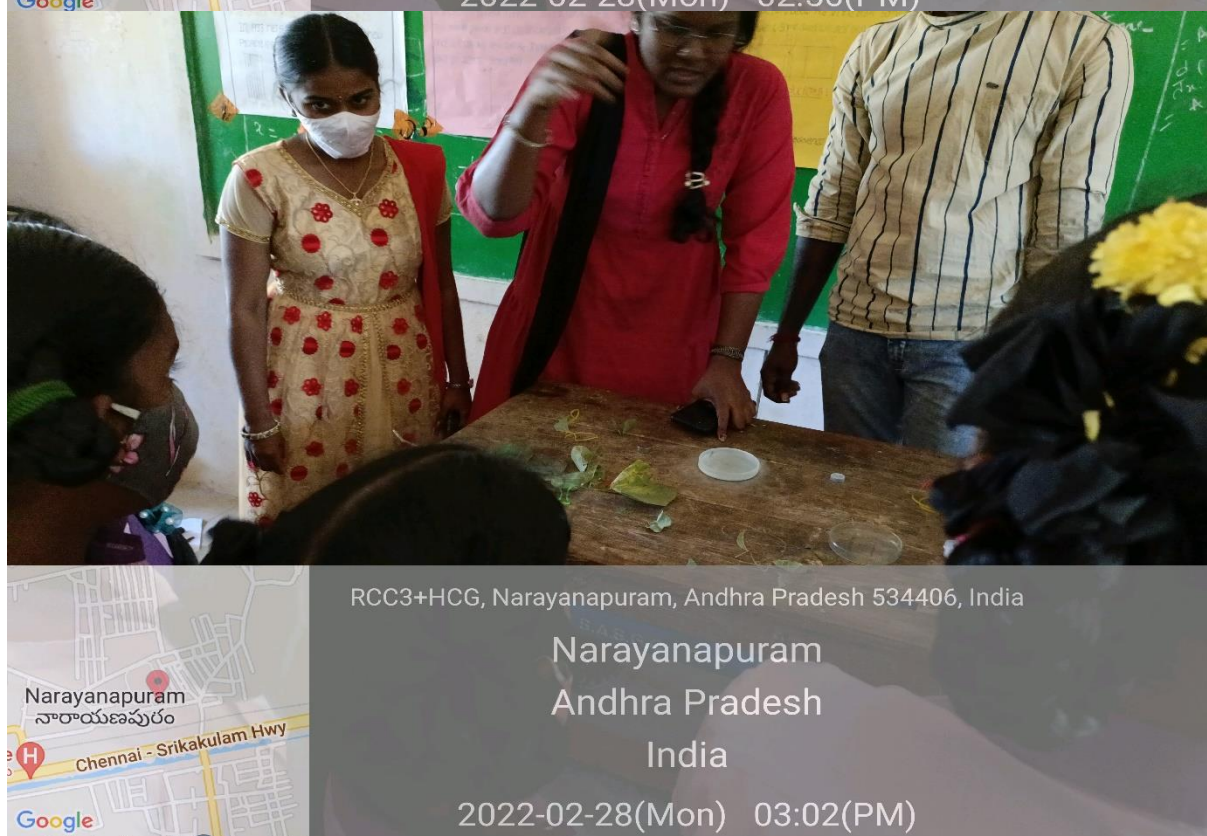
MP Elementary school children surprised to witness liquid nitrogen